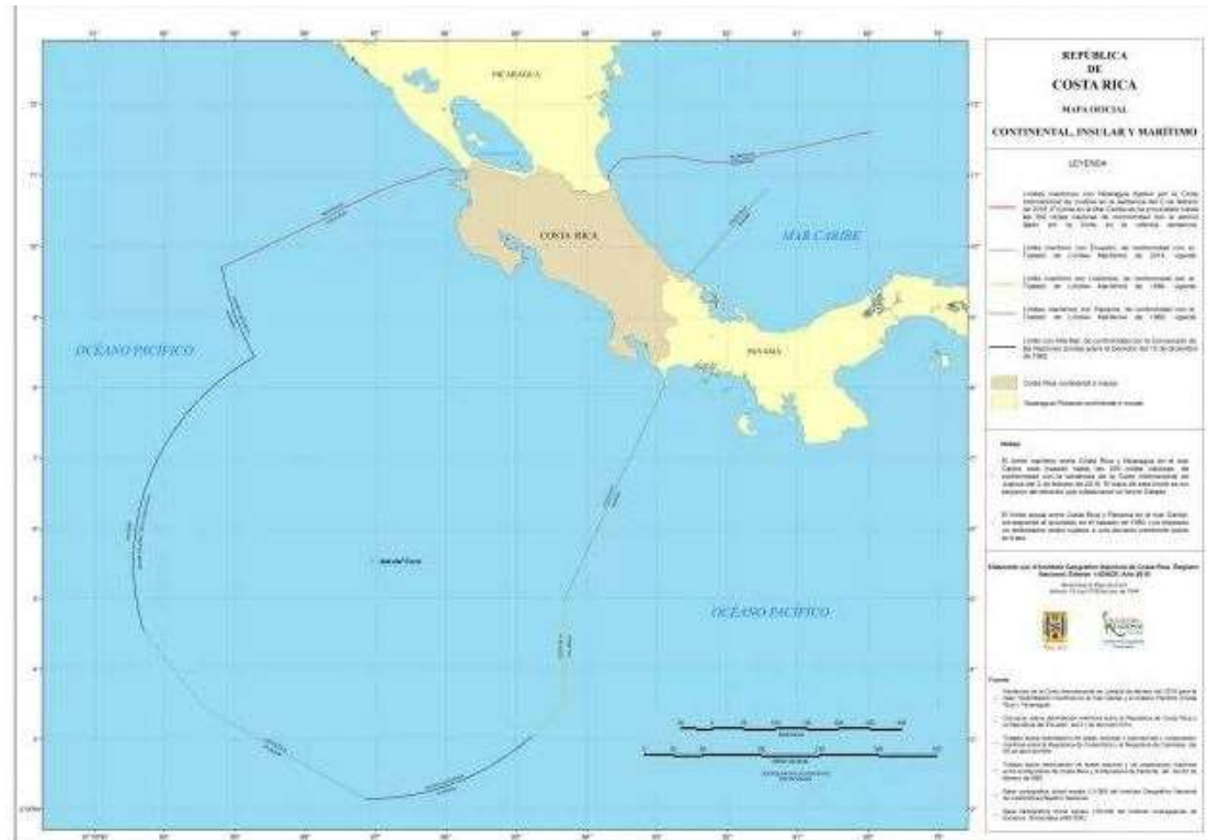
Este es el mapa oficial que muestra todo el territorio continental, insular y marítimo de Costa Rica. Cartografía elaborada por el Instituto Geográfico Nacional.